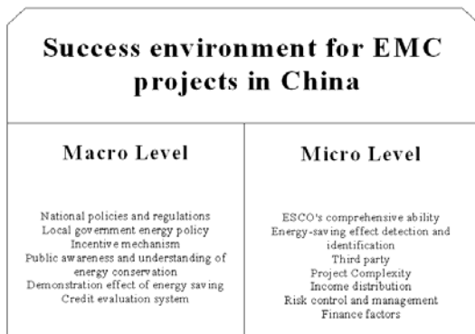
FIGURE II. SUCCESS ENVIRONMENT FOR EMC PROJECT IN CHINA