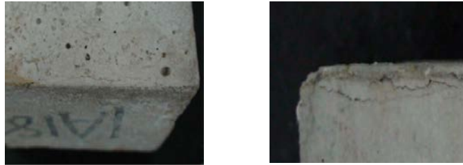
Fig.2 Mid-stage test phenomenon of corrosion

To continue with the corrosion test, in the test medium, after some dry-wet alternate cycle, the color of test block to deepen. The edges can already see the collapse, the mortar off situation. As the corrosion to continue, microfractures expand gradually, and gradually formed obvious cracks. It is shown in Fig.2.