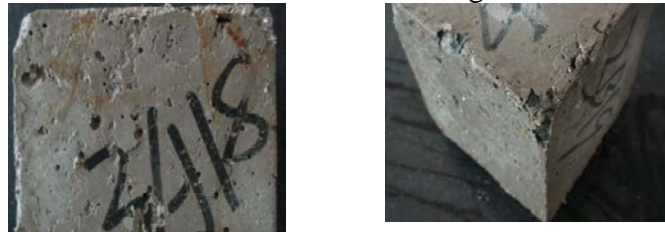
Fig.3 Late-stage test phenomenon of corrosion

Late corrosion, the internal erosion that corrosion solution to the concrete makes the test block color turns to yellow. The middle of the crack has been generating obvious cracks. Some sand lose the effect of cementation and fall off, causing uneven surface, and surface hardness is decline seriously. Test block corner interface shape is irregular, and some performance index both are decline. In the end, the outer layer of the test block is get to crisp, and integrity is suffered heavy damage. Illustrate sulfate corrosion is more obvious. It is shown in Fig.3.