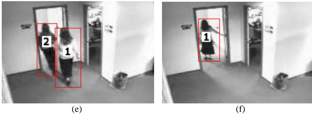
Fig.1. The tracking results