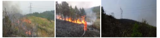
FIGURE III. WILDFIRES EXTINGUISHING NEARBY TRANSMISSION LINES.

According to the history statistics of wildfires, massive mountain fires often occurred during the period of Tomb-sweeping Day all around China, which resulted in the trips of transmission lines and the severe threat to the safe operation of the grid[8]. During the period of Tomb-sweeping Day in 2014, State Grid Hunan Electric Power Company deployed five portable fire extinguishing equipment, and the total area of extinguished open fires was 3,500m 2 in April 4-5. The lines of 110kV and above of the Hunan grid did not suffer from the accidents of mountain fire trip, which set a record that there was no trip occurring in the Hunan grid during a no-rain Tomb-sweeping Day, marking a great breakthrough of the technology against wildfires of the grid, and ensured a strong support for the safe and stable operation of the large power grid. The application of the portable fire extinguishing equipment means that the characteristics of the equipment includes safe drive, long water-delivery distance, high lift and good performance for fire-fighting, which can solve the problems of the bad traffic at the sites of transmission line mountain fire and the tough access to water, and fill up the gap of equipment for transmission line mountain fire fighting in China.