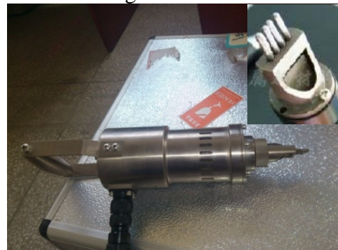
Fig.1. HJ-III type ultrasonic impact equipment Fig.2. UIT tool and pins

Microstructure test procedures. The microstructure of cross section of base metal and treated surface of welded butt joint was observed using the optical microscope of Axio Vert.A1 type (made by Carl Zeiss, Germany).