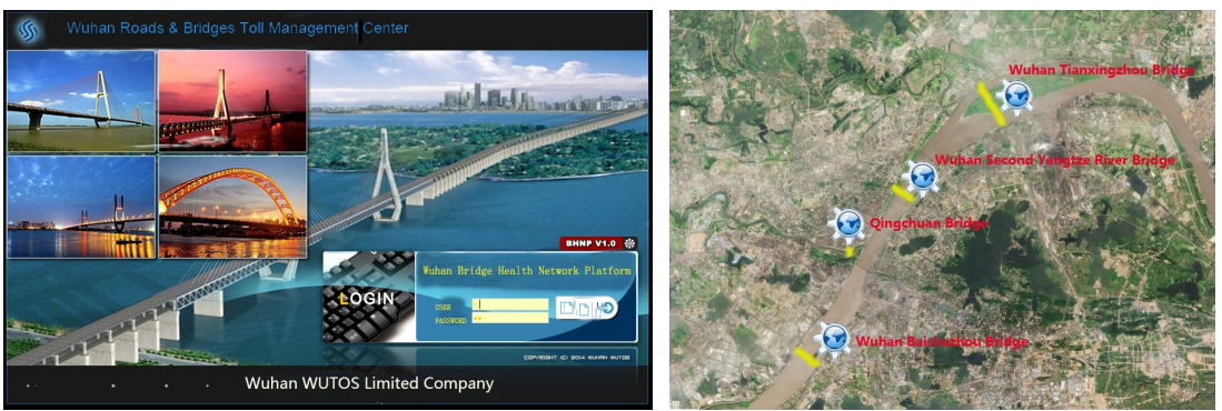
Figure 3 Screenshots of WEB software