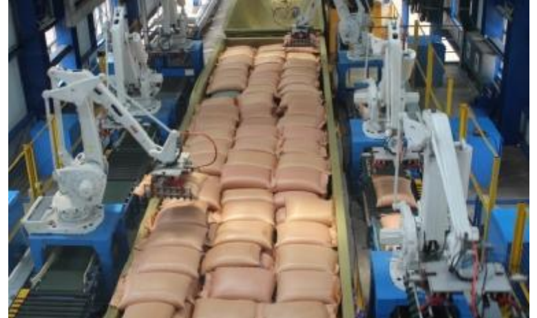
Figure 2 the workshop scenarios of robotic package-stacking

The stacking robots were essential parts of the whole system. They could carry out the stacking operation for the bagged material in accordance with specific types of train carriage. Six stacking robots covered the whole working area. Each robot is responsible for a specific region according to the procedures. Intelligent control was applied to ensure the stacking process reasonable and orderly.