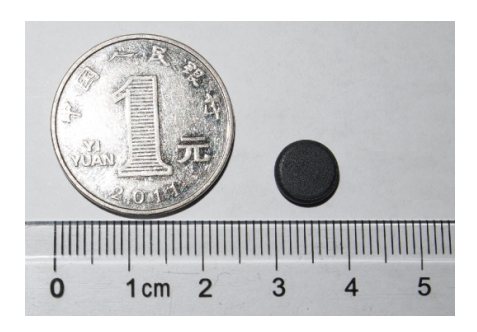
Fig.1 Traditional RFID Card