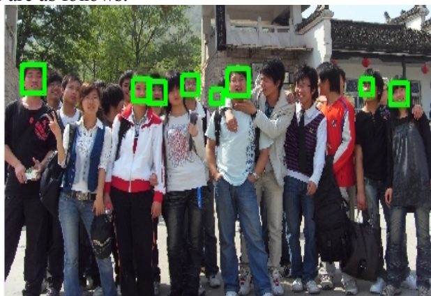
Fig. 2 Effect diagram of face recognition 3: Total 13/Miss 6/Error 1

The first to introduce is the part of face detection, the interface of this part is simple which mainly processed the image in background (by adopting Adaboost algorithm to detect). Just read in an image and then detection. Results are as follows: