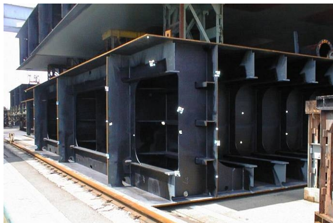
Fig.5 Japan IHI Corporation measure the shipping component radial line

Ship Manufacturing. Compared with other industries, shipbuilding product is diverse by its large size. Close-range measuring system can guarantee the accuracy of the measurement range of dozens of meters, so it is an ideal tool for ship parts in the dimensional measurement. Japan IHI Corporation measure the shipping component radial line is shown in Fig.5