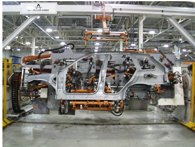
Fig.4 Measurement on BMW X5 BMW series automobile side panels

Automotive Industry. In the automotive industry, product parts usually need for mass production and high production efficiency. It is available to complete the pointing and measurement of large auto parts by using close-range photogrammetry measuring system and online measuring system, thus improving vehicle productivity. Usage of close-range measuring system for BMW X5 BMW series automobile side panels is shown in Fig.4.