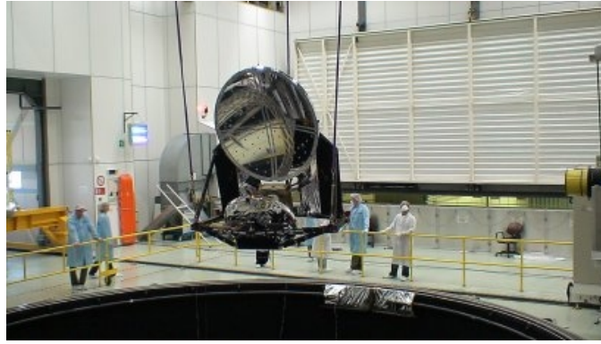
Fig.3 European Space Agency measure the deformation of astronomical telescope

Automotive Industry. In the automotive industry, product parts usually need for mass production and high production efficiency. It is available to complete the pointing and measurement of large auto parts by using close-range photogrammetry measuring system and online measuring system, thus improving vehicle productivity. Usage of close-range measuring system for BMW X5 BMW series automobile side panels is shown in Fig.4.