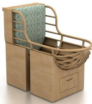
Figure 1 baby bed using

Figure 1 is a normal baby bed under the way of use, inherited the characteristics of the traditional the cradle of the crib, surrounded by the type of bird's nest. The baby is sleeping of time can also be realized in the mother's belly feeling, also is the parcel, resulting in a sense of security, improving the quality of the baby sleep. Figure 2 is the crib conversion seat after use, so that people sit in the half open seats, feet can be put on the pedal, making the body more free and comfortable, but also create a personal illicit close space, more human.