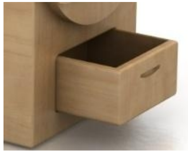
Figure 4 storage drawer

Through the details of the design, add a drawer to receive a function makes the whole design more rational and functional, believe that such a new design to give new life to this baby bed, more human, more practical. As shown in figure 3,figure 4.