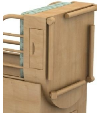
Figure 3 seat legs in