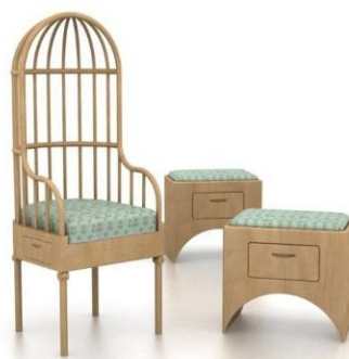
Figure 2 seat state of use