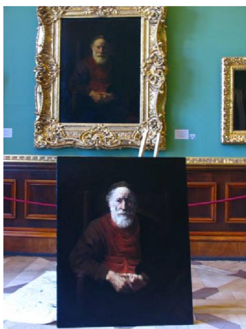
Fig. 4 Tracing of Rembrandt "Old Man's Portrait" - Completed Work

According to the hue of the original work, select yellowish brown, reddish brown, ochre, burnt umber and other soil colors as well as bright red, emerald green, cobalt blue and other high-purity colors of good transparency. Use Mattie resin as transparent color paste (it is available in market, or it can be replaced by megilp; but its effect is not as good) to mix color. It would be better to use soft brushes. Turpentine can be used as diluent. By staining picture in part with this color, you may be surprised to find that the color of picture is like flowing colored transparent glass, full of luster. The black, white and gray of sketch are revealed under other colors, creating a special gray color, especially in the transition of bright gray on face and blue veins on hand. It would be transparent and vivid, which couldn't be realized by the direct painting method. Use less opaque color to take advantage of the brightness of color and achieve the effect of original work. Stain the painting for a few times and achieve the saturation effect. Repeat it when it is dry. When the painting is nearly dry, stains the whole picture with extremely light ochre and burnt umber mixing with transparent color paste. Use opaque color for few details. Fig. 4 is the completed work.