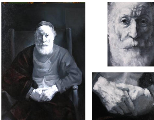
Fig. 3 Tracing of Rembrandt's Old Man's Portrait - sketch details

According to the hue of the original work, select yellowish brown, reddish brown, ochre, burnt umber and other soil colors as well as bright red, emerald green, cobalt blue and other high-purity colors of good transparency. Use Mattie resin as transparent color paste (it is available in market, or it can be replaced by megilp; but its effect is not as good) to mix color. It would be better to use soft brushes. Turpentine can be used as diluent. By staining picture in part with this color, you may be surprised to find that the color of picture is like flowing colored transparent glass, full of luster. The black, white and gray of sketch are revealed under other colors, creating a special gray color, especially in the transition of bright gray on face and blue veins on hand. It would be transparent and vivid, which couldn't be realized by the direct painting method. Use less opaque color to take advantage of the brightness of color and achieve the effect of original work. Stain the painting for a few times and achieve the saturation effect. Repeat it when it is dry. When the painting is nearly dry, stains the whole picture with extremely light ochre and burnt umber mixing with transparent color paste. Use opaque color for few details. Fig. 4 is the completed work.