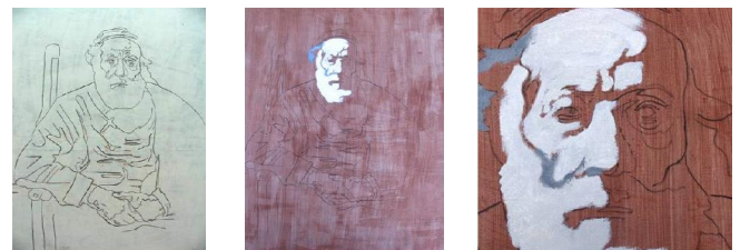
Fig. 2 Tracing of Rembrandt's "Old Man's Portrait" - with colored base

The canvas with colored base can be applied with acrylic color and watercolor to replace mineral color that ancient artists used. Blend them in when you apply the last layer of bottom material, as shown in Fig. 2. In ancient times, artists control the drying rate according to their needs. Some artists even added oily materials into base. The More oil painter applies the slower the drying rate is. The method of rubbing painting is similar with that of sketch. It should be specially pointed out that we can print a black and white painting if the works is in a large size. We can use the printing painting for rubbing. Use light ink to draw outline; Refer to the white and black draft and draw the sketch relationships with white and black color according to the original work. In drawing sketch relationships, it is required to draw all details and texture, in line with the original work. The color of finished painting is slightly light than that of the original one. When it is dried, continue the next step, as shown in Fig. 3.