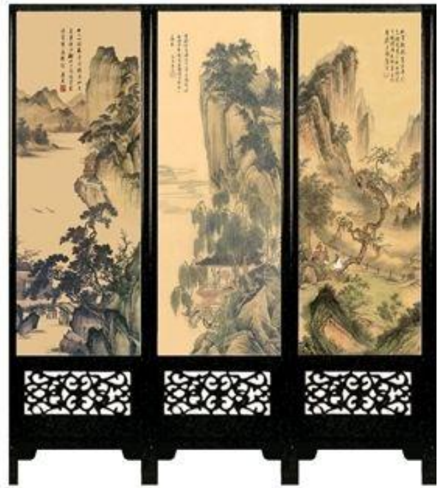
Fig. 6. Screen