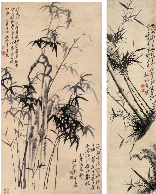
Fig. 1. Poem painting of Zheng Banqiao