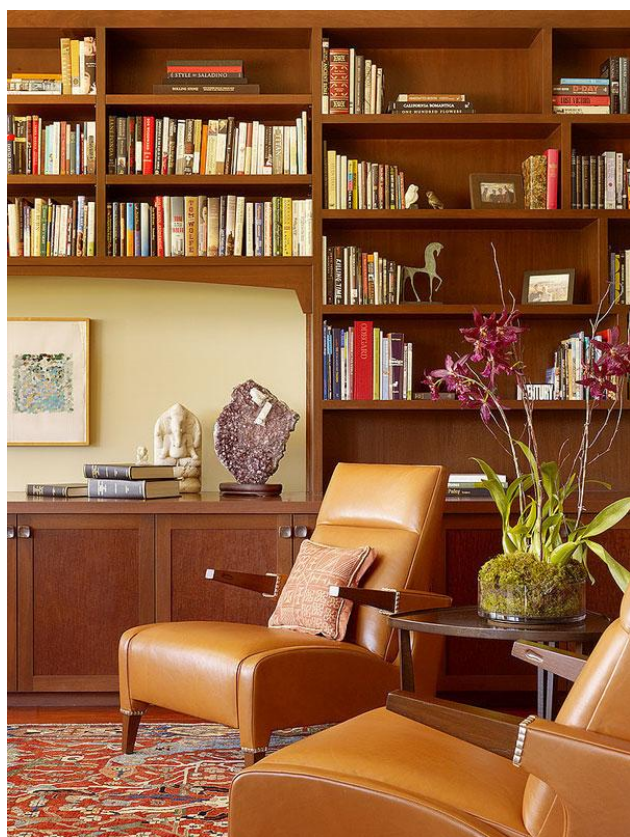
Fig. 7. Bookcase display

Displaying books is different from calligraphy and painting. It belongs to a kind of indoor functional display. The richer a person's life, the more attention will be paid to the appropriate display of books. Generally speaking, books are put on bookshelves. Only a few books people often read are displayed freely. The traditional bookcase is generally fairly organized, but a little bit stuffy. Actually, we can choose a case to suit the space and atmosphere according to actual indoor demand "Fig. 7". Size, color and package can all help to display books in classification. It can also help for the bookshelf to have a reasonable height, space and division. Sorting books orderly, in addition with books standing or crossing, can produce the flavor of furnishing. Small ornaments on bookshelves foil each other with books. The adornment effect is good. Plants, antiques, and small decorations are good partners for books display. Their interspersed layout can add interest to a bookshelf and reflect the host's taste of life. A little bit of sorting out of scattered books could also achieve an illuminative effect.