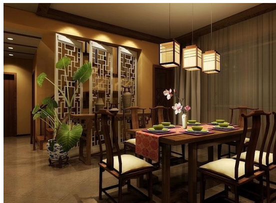
Fig. 3. Examples of space

national culture, which can express feelings and cultivate taste. This kind of culture does not stay on the surface but pursues artistic conception. It is not on the basis of realism, but the pursuit of similarity in spirit. So in the field of interior furnishing, the spatial awareness reflected by poetry, calligraphy and painting should greater reflect inherent things.