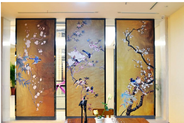
Fig. 5. Screen