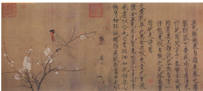
Fig. 2. Song paintings