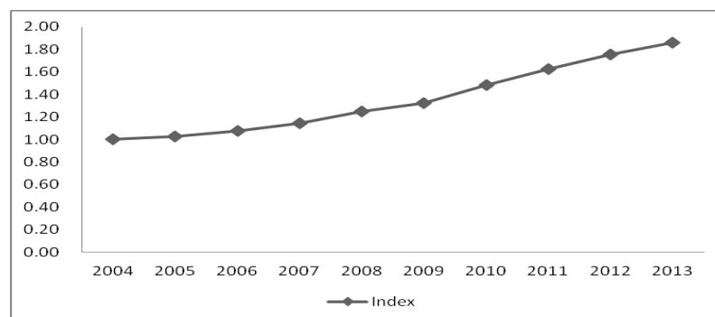
Fig. 1 Comprehensive Evaluation Results of 2004-2013 Agricultural Recycling Economy in Hebei

Process and calculate data collected by using the above evaluation method to obtain the results of comprehensive evaluation of Hebei agricultural recycling economic development (as shown in Fig. 1). It can be seen from Fig. 1 that in general, in 2004-2013, the development level of Hebei agricultural recycling economy gradually improves, and the comprehensive evaluation index of 2013 recycling economy is 1.86 times of that in 2004. during 2004-2006, comprehensive index of recycling economy is between [1,1.08], comprehensive evaluation index rate of change is slow, the average annual rate of 3.9 per cent rise for the infancy; period from 2007 to 2009, the circular economy index living between [1.15,1.32], with an average annual growth rate of 7.1%, for the acceleration phase; 2010 economic composite Index to 2013 living between [1.48,1. 86], with an average annual growth rate of 7.9%, in a relatively stable stage.