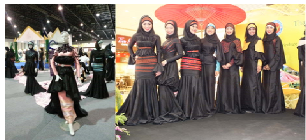
Figure 2. Prototype of Muslim women's Dresses form Thai Silk

3.3 The results found that there were significant changes regarding knowledge improvement of attendees at .05, which included silk's decorations, pattern making and producing Muslim women's clothing. In addition, attendees received the most benefits from pattern making and Muslim clothing production (at 4.70). In term of production efficiency improvement, it was found that the samples of manufacturers have four major problems, which were labourers, tools, materials, and processes. The improvement solutions were advised as 1) to increase working level for all staff, 2) to increase production efficiency and to reduce its capital cost, 3) to internationalise production level, 4) to increase on-time delivery, which was indicated to be a problem due to out-of-date machinery, insufficient working labour, and lack of up to date innovations [7].