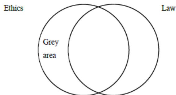
Fig.1 The relationship between ethics and the law