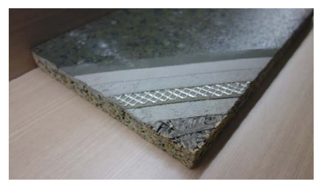
Figure 2: Wood wool cement board