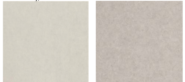
Figure 1. Mottling assessments: (a) sample 28, one of the better sample, with visual ranking of 0.5; (b) sample 1, in the lowest end of print quality, with visual ranking of 2.65

V = [2.65 \ 1.8 \ 1.4 \ 0.7 \ 0.85 \ 1.9 \ 1.8 \ 0.5 \ 2.0 \ 0.65 \ 2.5 \ 3.0 \ 1.8 \ 1.35 \ 0.9 \ 0.8 \ 2.65 \ 3.0 \ 1.8 \ 1.4 \ 0.7 \ 2.4 \ 0.5 \ 2.3 \ 2.4 \ 1.5 \ 1.2 \ 0.5 \ 0.4 \ 2.7] ;