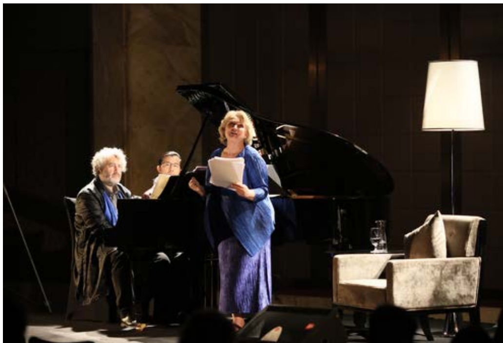
Fig.1 "Music and literature" tour photo

To explore the value and function of music literature, we want to observe shanzhai culture on different cultural perspectives. There are a lot of information feedbacks on the literature view. It reflects the different audience's psychological acceptance. The creativity of art space becomes stronger and stronger. Literature and music are not adapted to the individual form. The music under the literature view is paid more addition to the development of literature. The audience is not only master the meaning of literature, but also pursue the uniqueness of literature and expand the social function of literature. Based on the development of culture, it formed a specific cultural phenomenon. As shown in figure 1, Sofitel luxury hotels "music and literature" tour activities at Sofitel Wanda Beijing on May 8. The purpose of living is in the form of piano playing and reading interpretation of classical music and literature, for the audience to a French feelings with Chinese elements.