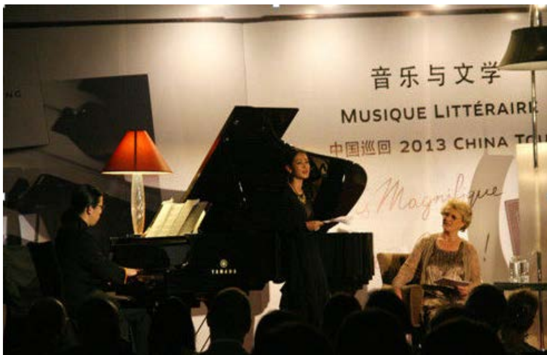
Fig.2 The revelation of music literature

In the process of music literature, it has many forms. Such as traditional drama and opera, modern musicals and score prose, etc. The common development of music and literature in a variety of forms are making progress and merging constantly. The fusion feature is reflected by the characteristics of music literature in society. Music literature is recreational, educational, artistic, and it shows the cultural function of literature, the revelation of music literature as shown in figure 2.