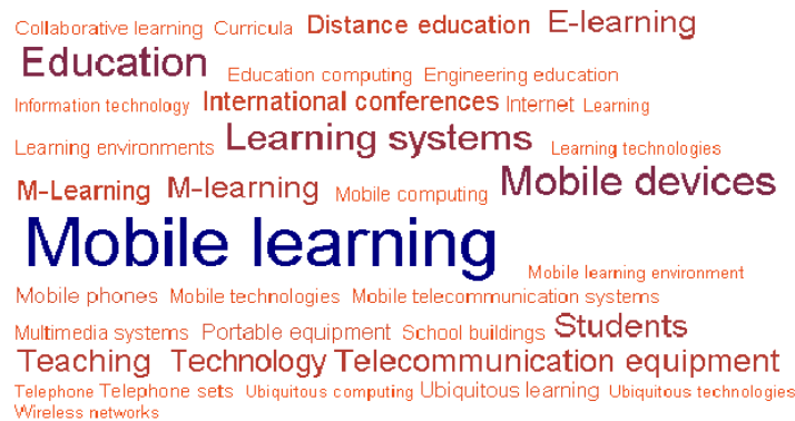
Fig. 3 Foreign researches on mobile learning on the tag cloud

Besides, the foreign researches on mobile learning on the tag cloud are shown in Fig. 3. It shows any sort of learning that happens when a learner is not at a fixed, predetermined location, or when a learner takes advantage of the learning opportunities offered by mobile technologies.