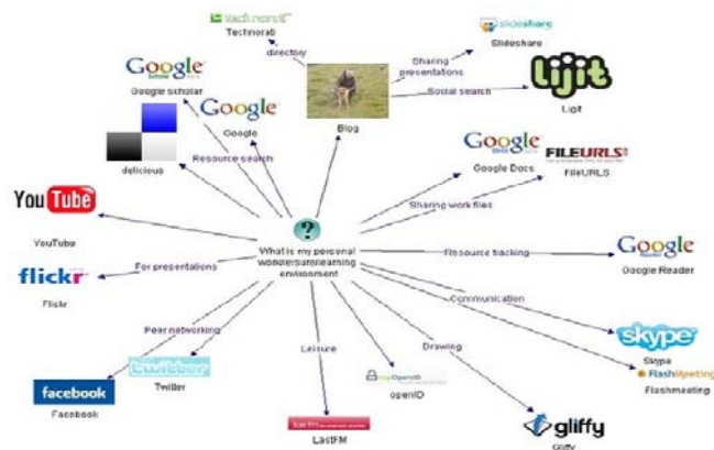
Fig. 4 Distance English learning environments

results transfer the final format to the users' mobile phone which they can eventually handle what is shown on the phone screens. The operational process is: after the users get into the modules of online testing, video on demand, English translation and dialogue scenes, they select the corresponding type and then perform related operations. Taking the users selecting the module of video on demand as an example, the processing program of the server will find out all video directory names related with the data in the database and then returned and presented them to the client. Additionally, as shown in Fig. 4, Martin Weller proposed a variety of learning environments providing various distance learning resources for the benefit of the learners.