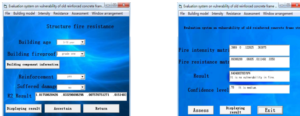
Fig. 2 The interface of the structure fire resistance Fig. 3 The evaluation result in scene one

(2)The hotel's structure fire resistance information is respectively recorded in the corresponding information the module, as shown in figure 2, to calculate the fire resistance ability of the construction of evaluation matrix. The results is shown in figure 3.