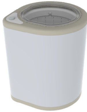
Fig.3 The final entity picture