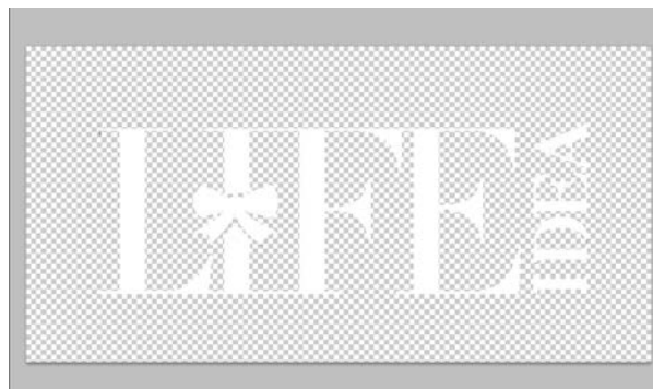
Figure 7 Trademark effect image after changing color

The original trademark is brown, while blue, white and other bright colors occupy the overall color of this poster. Trademark is also very important, poster itself not only need to convey some information of this order as well as clothing theme, but also need to convey the information that this order-placing meeting is held by “Life. idea”. And then we replace the color of trademark with white according to the background color - blue and this makes the trademark more noticeable in the background image. Later we select paint bucket tool in the toolbar and fill it with white as shown in Figure 7.