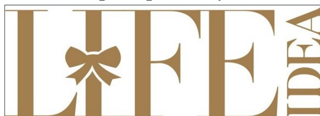
Figure 5 Original trademark image

We have basically completed the overall form of expression and leaved trademark and text unfinished. The purpose of creating logo is that when looking at this, customers and others will immediately know this is the company’s brand. As a result, the logo must be conspicuous but not over exaggerated. We open the trademark through using Photoshop software as shown in Figure 5.