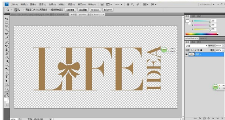
Figure 6 Trademark implantation image

Select the white background in this image, press “Select / Direction” command to select the constituency of trademark and create a new interface. Set the shading with transparent color, press “Ctrl + C” to copy and press “Ctrl + V” to stick, and then copy the trademark into new interface as shown in Figure 6.