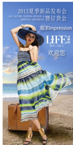
Figure 1 Final effect image

order-placing meeting more clearly and allows them to order their desired goods faster and better, the basic display is shown in Figure 1.