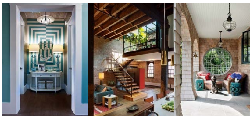
Fig 3. Secondary color

The Specifications and Performance of the Material. Material specification is refers to the shape, size, type, thickness, different specifications of the materials have different forms of aesthetic feeling, even if the same kind of material with different specifications in the form of combination, also formed different visual expression. Material specifications reflect a certain modulus, the material specification grasp can be fully the material of the decorative and practical, Material performance mainly refers to the quality of the weight, strength of soft hard, sound insulation, heat insulation, moisture, and mechanical properties, processing, wear resistance, etc.. For example, in recent years, the development of coated glass, insulating glass, laminated glass, heat reflective glass, not only