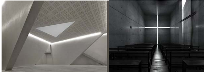
Fig 1. Tadao Ando- light and wind

Color. Color as the most sensitive, the most expressive visual elements, for the use of color in interior design very heavy. Color relative shape and texture, it produces the aesthetic feeling of tend to be more direct, synthetic-aperture power. Use of color can create an atmosphere of space, or elegant, warm fresh and romantic, beautiful and rich warm, excitement, celebrate joy, simplicity generous, use of color also divide the space, cause people in size, weight, temperature, expansion and contraction, forward, far and near etc. mental physical feeling. Solid color is natural color, in the interior design and construction without further processing, such as a variety of granite, marble, decorative panels, wall paper, fire board, plastic aluminum plate, etc. The colors of these materials should be reflected in the design of their own beauty, it is necessary for designers to choose and use according to the specific environment needs. Secondary color is according to the design of the space environment demand, changing color, in the use of materials for color processing; adjust the natural color of material, In order to achieve the harmony of indoor space color or contrast. Natural color and secondary color as shown in figure 2 and figure 3