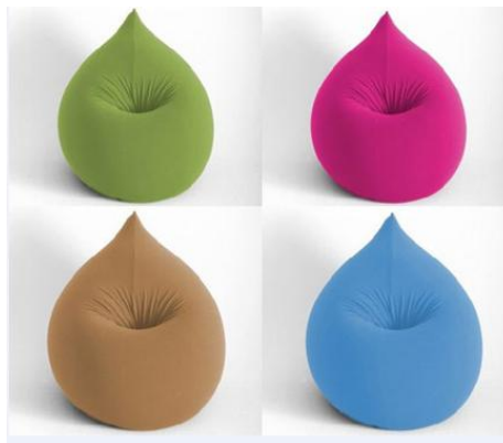
Figure 2. The Demonstration and Illustration of the Applications on Furniture Design

The Prospect and the Development. By using the theory of ergonomics to modern furniture design is inevitable in the development of furniture design. Only fully using the core