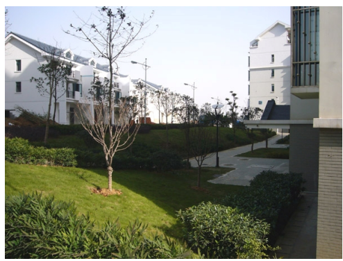
Fig. 3 Slope Design of Yu Yuan residential quarter

out gradually along the lowering elevation of the mountain from north to south. If the existing design rules are followed, it seems perfectly justified to convert the slope into platform by excavation and filling. However, it is somewhat a waste of resources for there is sufficiently large building interval. This kind of approach not only increases the construction cost of retaining wall, but also violates the basic principle of ecology on land connectivity. Based on the above understanding, the blunt platform is replaced by the slope with characteristics of softening surrounding environment in the vertical design of Yu Yuan residential quarter (Fig. 3). Such a design, in ensuring the land connectivity, is also designed to create a diverse and changing environment, wherein