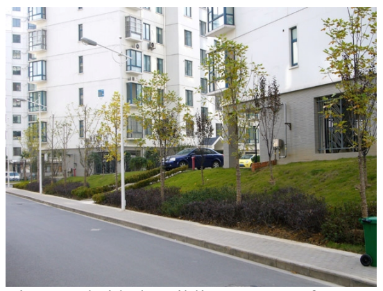
Fig. 1 Subsided Building Apron of Yu Yuan residential quarter

solidly-built walls, flower-shaped iron ones have a better permeability, and in the mean time the hollowed design ensure the freedom and liberation of human vision. But this is still not enough for