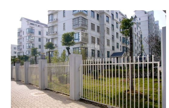
Fig. 2 Enclosure Design of Yu Yuan residential quarter

Thus, how to increase the permeability of walls becomes an important issue in ecological design on the condition that its defense function be guaranteed so as to maintain the interaction of life flow and material flow between campus and Yujia Mountain. Compared with