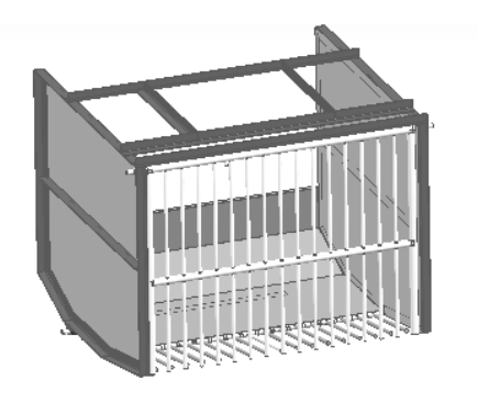
Fig.2 Structure diagram of the box

In this paper, the straw collecting box is design through the virtual 3D. Virtual design technology provides a product design environment, optimize the product design process, to research and development of new products provides a strong support. By using the virtual design technology, which can improve the design quality, reduce design errors and manufacturing costs [3, 4]. On the basis of the structure scheme and the main technical parameters of the straw collecting box, the structure of the set of the straw collecting box is designed by using UGNX software. Its main structural design is as follows, such as the structural of the box design (Figure 2), the structure of the claw disc design (Figure 3) and the structure of the connecting rod design (Figure 4).