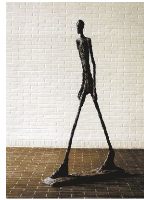
Fig.2. [Swish] Giacometti Alberto Walking Man