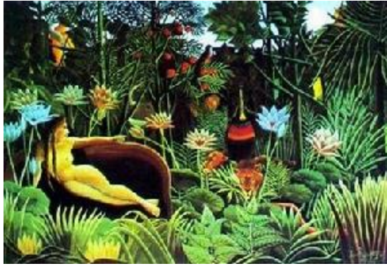
Fig.1. [French] Henri Theodore Rousseau Dream