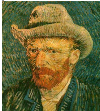
Fig.3. [Dutch] Vincent Willem van- Gogh Self-portrait