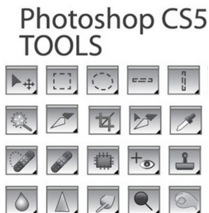
Fig. 2 CS5 multimedia courseware production software

Figure 5 shows the production of multimedia courseware. Multimedia courseware is the main technical means of modern Chinese language education, the use of CS5 multimedia courseware production software can effectively improve the production efficiency of courseware. For the text of the image rendering and synthesis, it can improve the production effect of courseware, so as to create a better teaching situation.