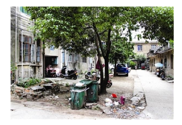
Figure 2 Scattered garbage in old urban residence

The lack of public facilities. Some old residential quarters, beginning of the construction, but in order to solve the housing difficulties of the residents, planning is relatively simple. Contradictions resident activities, public green space, bicycle storage, parking and other facilities and people's actual needs are quite prominent, sanitation facilities are not complete, and some do not trash and garbage transfer stations, garbage rooms, toilets, etc. Fruit Housing Box set too less, in some places even a blank. Most existing public facilities district plan allocation ratio is low, only a few public facilities and some have been diverted to other purposes, some