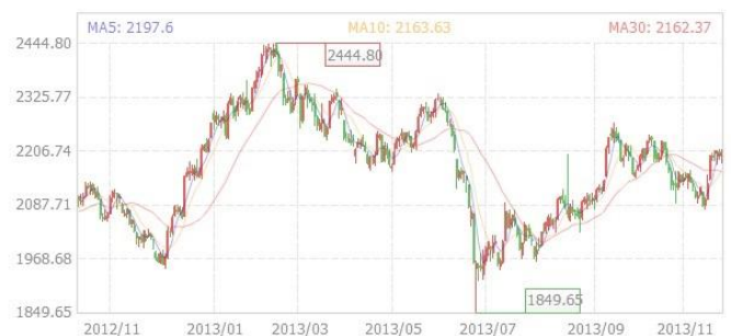
Figure 2. SSE composite index history data from netease (November 1, 2012 to December 1, 2013).