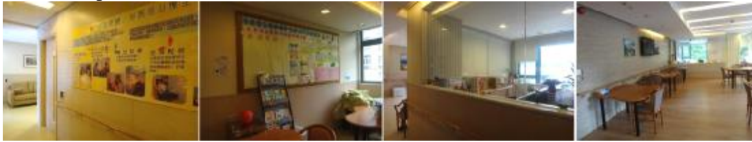
Fig.4 Day care center, community elderly service center interior space

Day care center and community elderly service center are set on the forth floor (Fig.4), which is main in community services. They provide the home elderly and their family nursing service, rehabilitation care service, so that they can continue the group life in the community. Professional home care service is also provided for the elderly, emphatically in elderly support and training, to help them relieve pressure.