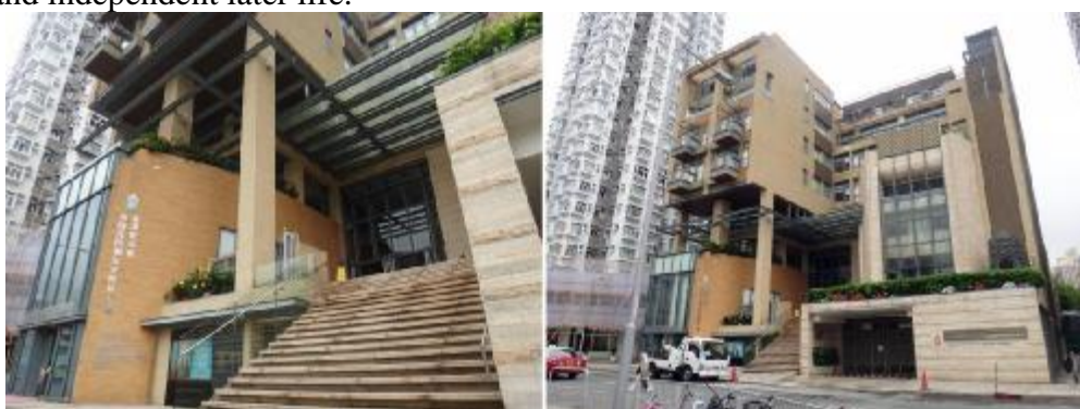
Fig.2 Hong Kong Sheng Kung Hui Elderly Service Building exterior view

Hong Kong Sheng Kung Hui Elderly Services Building, located in Sha Tin District, provides a comprehensive one-stop service platform for the elderly in a self-financing mode of operation (Fig. 2) The services include stroke and orthopedic rehabilitation, physical therapy, occupational therapy, speech therapy , counseling, social support, catering service, and 24-hour nursing care, personal care for the elderly. In addition, the elderly and family can have choices with needs, like elderly homes, day care center and community outreach services, so that the elderly can enjoy a comfortable, cozy, respected and independent later life.