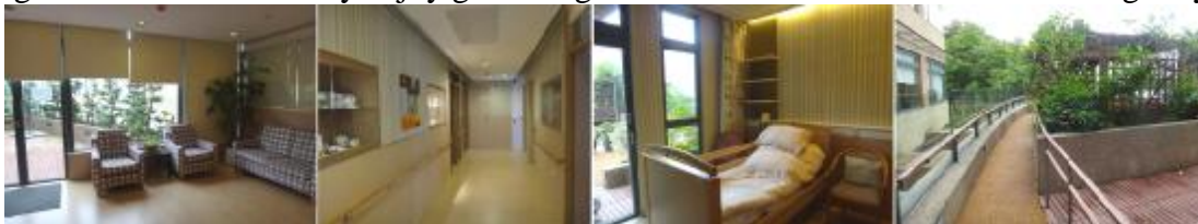
Fig.5 Home for the elderly interior space

Fifth floor to seventh floor are for elderly home (Fig.5), with innovative planning and design to achieve the warm family atmosphere. There are single or attached single rooms, triple and quadruple rooms for a variety of options. There are also Greenery Garden platform for the elderly to stroll, and planted garden can make elderly enjoy gardening fun. All those build character and longevity.