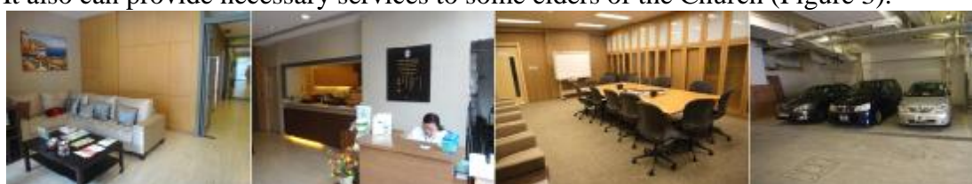
Fig.3 Reception center, meeting room, parking lot interior space

In entrance space on the ground floor, there are reception center, offices, conference rooms, parking lot, kitchen, laundry rooms and other services; second and third floor are for the Spirit Anglican Church, supported by the NGO to promote area elderly service with the mission of love and peace. It also can provide necessary services to some elders of the Church (Figure 3).