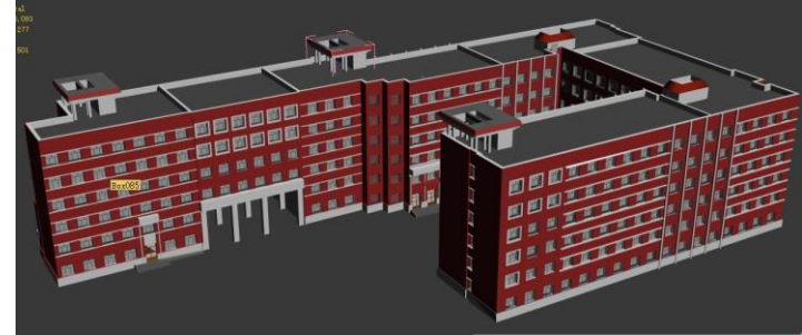
Fig. 2. Overall effect map of the third apartment building

graphics, and then use the "extrusion" command to the height of the building as the "extrusion quantity" for extrusion. The overall effect of the third apartment building is shown in Fig. 2.