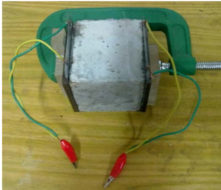
Fig.2 Photo of measuring the electric resistance of concrete

isolation plates together regularly, shown as Figure 2. try to less fixture force if well-connected and keep the force same every time.