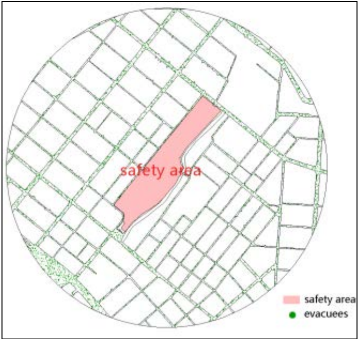
Fig. 1 The evacuation scope

Gate of the park have entered the safety area, but a large number of evacuees still gathered in the North Gate, waiting to enter. It shows that the evacuees in this entrance will take more time to be evacuated.