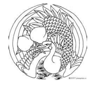
Fig. 1. The immortal crane in longevity

Auspicious concept originated in the primitive society, and auspicious awareness generated from the confusion and fear of the ancestors for human disease, pestilence, natural disasters and death and from the horror for hunting, killing and eating the living being. They need some force to help them expel the demons, eliminate the disasters, bless the safety. Thus the images that make the devil afraid are created, to become the patron saint of the clan. On the base, a large number of artistic images combining the features of human and animals and plants are created. These mysterious and wonderful icons become the most primitive form of religion, which is also the start of auspicious patterns, such as "Fig.1".