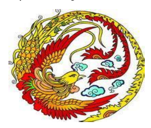
Fig. 4. The pattern of phoenix

"Two dragons are playing with a pearl ", "a flying dragon and a dancing phoenix", "a phoenix in morning sun". The patterns of kylin and clouds include "kylin offering a son" and "kylin offering riches and honour". An auspicious knot that is made with two forever-connected lines, expresses "a stretch without a break", "a life in endless succession" and "good luck as desired", such as: Panchang knot, Fangsheng knot and Ruyi knot. See "Fig.4".