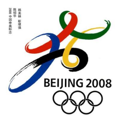
Fig. 8. Bid Logo for 2008 Olympics