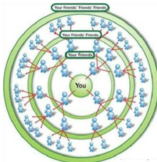
Fig.2 transfer mode of micro blogging

The traditional mode of transmission is a "linear transmission", and the dissemination of micro Bo as the "fission type", its area and speed are unparalleled. The dissemination path of the micro blog can be a person released information [4][5], his fans can receive the information in time. You can also forward to others good micro blogging, so as to achieve the rapid spread of micro blogging. So, a micro blogging message through the user forwarded to the surrounding rapid spread, causing more and more people attention, communication as shown in Figure 2.