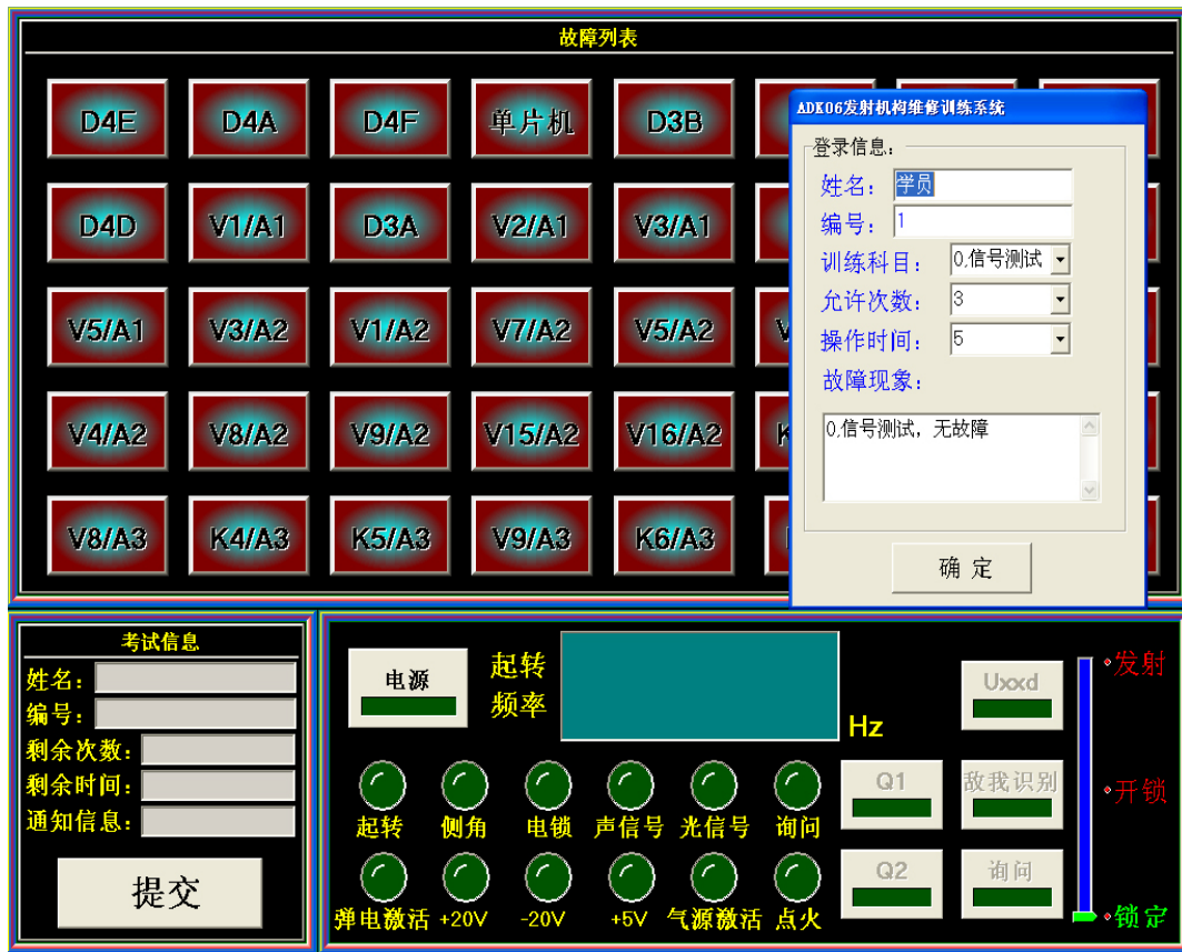
Figure 2 Software interface