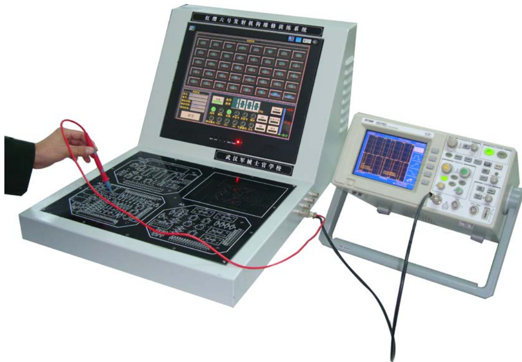
Figure 3 LCE use

b) Abundant maintenance training means, increase the number of maintenance training group