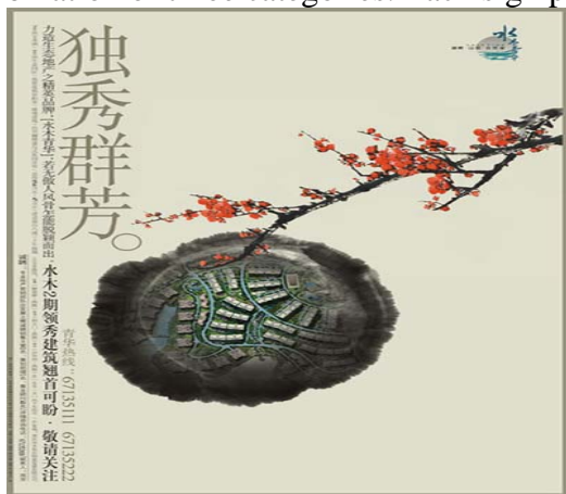
(1) an advertisement for real estate

In the following advertisement (1), we can find all of the three categories of signs combined in this little picture. A figure of traditional Chinese painting represents iconic sign, scenery of buildings peers from behind the indistinct stain of ink, which presents as indexical signs implying a project of a real estate, and several Chinese characters, representing symbolic signs, are arranged on the left side of whole picture in traditional Chinese orders. Firstly, this advertisement gives people an aesthetic enjoyment owing to the contribution of Chinese painting (iconic sign). With its lively air of Chinese tradition, people can easily associate the product with traditional Chinese culture. Then, with the move down along the branch of club, buildings unveil from the drop of ink, indicating people that the product is about a set of real estate. So far, the audience has gained a brief outlook of the product; however, to add more information, the Chinese characters by the left side make the proper effect. In Chinese culture, the plum blossoms represent an outstanding and superb personality or achievement. Here it symbolizes the project as a superb work of realty industry. This is just the perfect effect of the combination of three categories. Each sign plays its own trick and meanwhile helps the others.