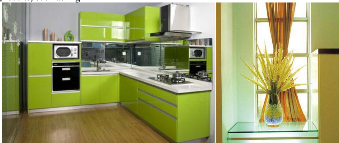
Fig.4 color design of assisted areas

Secondary zones are mainly space with water or fire. Water, fire, health, ease of maintenance and other functions are necessary conditions. When designing in this area and bright, pure is the best color matching results, such as Fig 4.