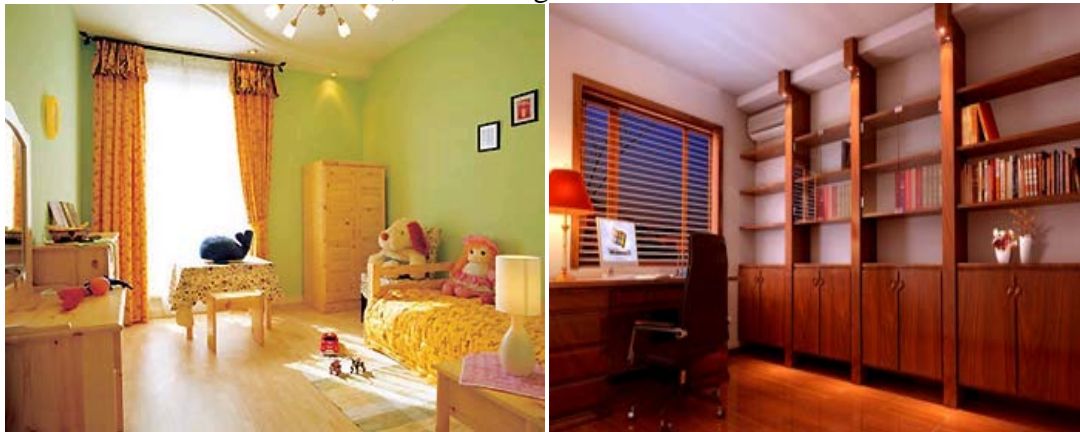
Fig.3 color design of private areas

Dedicated areas can be used in preference to decide what color to match the color design space according to each user's preferences. Features and nature of the region itself to make the color space designed with individual characteristics, such as Fig 3.