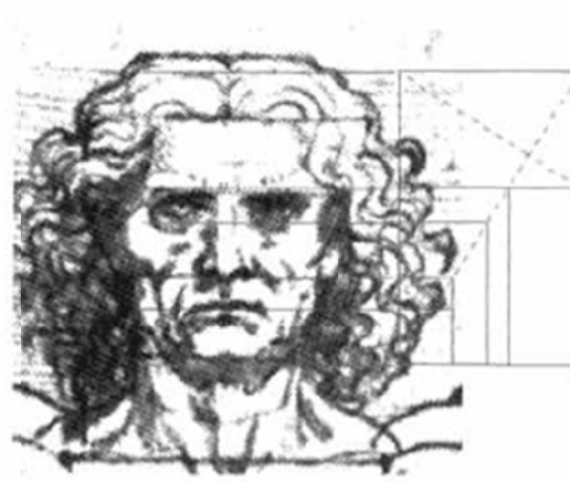
Figure 2 painting works in strict accordance with the golden ratio