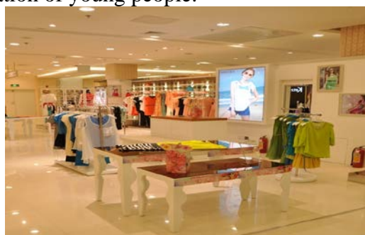
Fig.2 department store

Department store sales Features. Apparel sales are used in the counter sales and self - selling model, the department store of the type of goods is very much, the profit is high. Department store to take a unified pricing and sales, the purchase of clothing can also be returned and shopping guide to help buy, department stores and more in the city center downtown area, it is decorated luxury, it is more than the target population of young people.