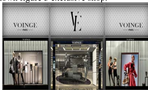
Fig.3 exclusive shop

Exclusive shop sales features. Stores have the obligation to maintain and spread the image of clothing brand, the manufacturers have to suit their own clothing brand features, lighting, display requirements, at the same time, manufacturers are required to design and layout of all stores in accordance with the same style, so that the practice of all stores unified and give consumers a unified image, so that they have a strong visual impact, so that the characteristics of brands and products will be displayed, such as retail stores such special retail terminal business philosophy to play the most vividly. As is shown figure 3 exclusive shop.