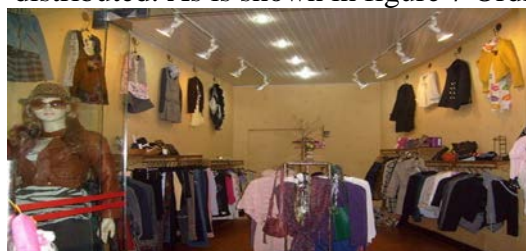
Fig.7 Ordinary clothing store

Ordinary clothing store sales model characteristics. Apparel industry product variety, brand and manufacturing companies, and this has caused a large number of retail organizations of different styles, especially in ordinary clothing store type and quantity as the most, decorating store image and layout vary widely, with other types of compared to clothing retail organization, ordinary clothing store is not fixed operating a brand or several brands, either chain enterprises, self-employed can also be a single store. Lack of standardized management, the target group is mobile customers, are widely distributed. As is shown in figure 7 Ordinary clothing store.