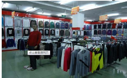
Fig.4 general merchandise store

General merchandise store sales Features. General merchandise store is a large scale, low cost, high volume, self-service shopping place, it is mainly to appease the consumer to food, daily necessities and a part of consumer goods, such as clothing, home appliances and other retail organization. It is through a large area of display products, easy to buy, low price to attract customers. But the shopping environment and service is not as high-end department stores.