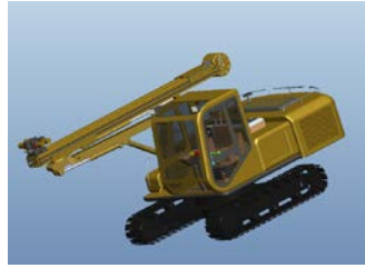
Figure 1 The three-dimensional model of jumbolter