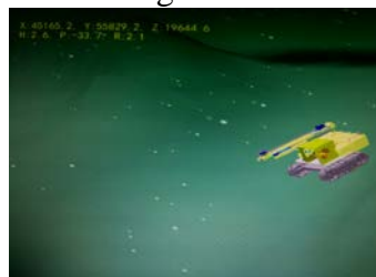
Figure 3 jumbolter in virtual reality

Achieve the jumbolter virtual simulation diagram as shown in figure 3.