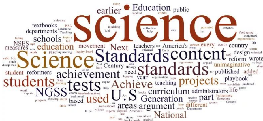
Figure 2. The Keywords of the Education Pattern Transformation

Local undergraduate colleges and contemporary universities to university of applied technology transformation its personnel training specification positioning should shift from cultivating academic talents for fostering development-oriented and the advanced technical skills and innovative talents. To transformation of applied technology university aims to meet the social development of science and technology for the advanced technical skill talented person's demand, the key is to design the corresponding talent training plan and course, and core curriculum must pay enough attention to and including the real production technology and processes, professional course content must links up with professional standards to strengthen the integration of teaching [7].