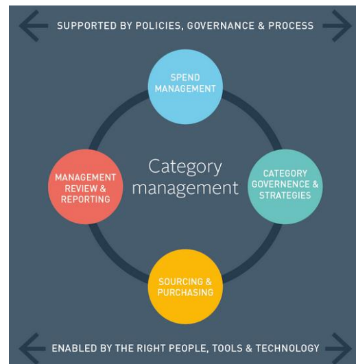
Figure 2. The Primary Architecture of the Category Management

The Category Management. Category management six main factors include strategy, business process, rating scale, ability of organization, information technology and trading partners relations of cooperation, there are two key elements is strategies and business processes. In order to make the core essential factor effectively, the other four to this element, namely the general rating scale, ability of organization, information technology and trading partners relations of cooperation that is the six key elements in performing category management decision-making and critical business processes.