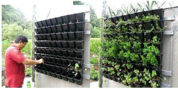
Figure 2 Carrier system