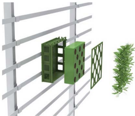
Figure 3 Modular system

Modular system mainly consists of three parts: the greening module, the structure system and the irrigation system. The Figure 3 shown greening module form a green surface by fixed to the buildings with system structure and support frame connecting planting panel and building walls. In general, corrosion resistance and highly intensive stainless steel frame are selected to well meet the requirements to ensure safety of plant panel and firm connection. The arrangement of irrigation system is consistent with frame structure which is convenient to provide water or liquid fertilizer to each unit module [3].