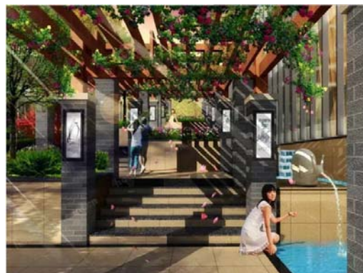
Figure 6 Carrier system on opening framework

The first method is that plants wind and cling to the balcony fence, invisible anti-theft network or erection of scaffolding form. Vines planted in containers or planters climb following veranda fence and invisible network security and form green screen. Climbing and twining vines for the balconies commonly used such as Ficus pumila and Hedera nepalensis var. sinensis , some vines with flowers including Ipomoea nil , Wisteria sinensis , Ipomoea quamoclit , Rosa chinensis and so on, some vines with ornamental fruits are chosen such as Vitis vinifera and Luffa aegyptiaca .