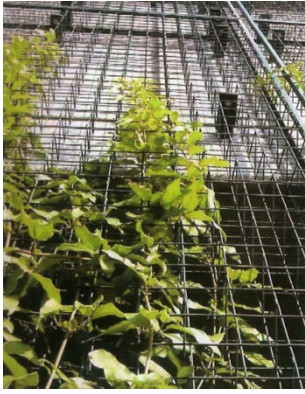
Figure 1 Climbing system