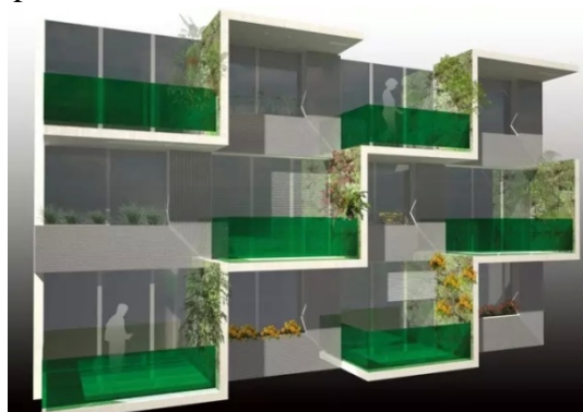
Figure 5 Balcony with carrier system

In the urbanite of the life in ferroconcrete city, the balcony is the important media residents connecting with outside natural world. Adding vertical greening into balcony can decorate the building's interior environment as well as giving pleasure. Layout options of residential buildings in southern China mainly distribute in the north-south direction with the characteristics of southern balconies with long sunshine and good ventilation. Climbing system and Carrier system are easy to maintain and manage so as to choose for balcony vertical greening. Plants are advised to select Shallow-rooted plants with features of heliophyte, drought and heat resistance, well-developed horizontal root system and extensive management and some small herbaceous vines or flowers. The following shows three types of vertical greening with low maintenance and management and better landscape effect.