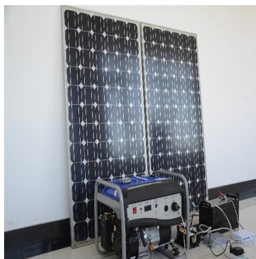
Figure 2. The product figure