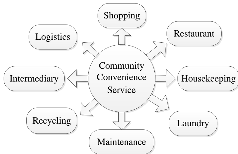
Figure 1. Function of Community Convenience Service

Function of Convenience Service. Based on community residents' variety for the demand forms of community convenience system, the most important realization forms of community convenience system was the function of convenience service. Convenience services should include certain the participation of the masses, let the residents involved in the convenience service naturally. The concrete implementation direction of convenience services as shown in Fig. 1.