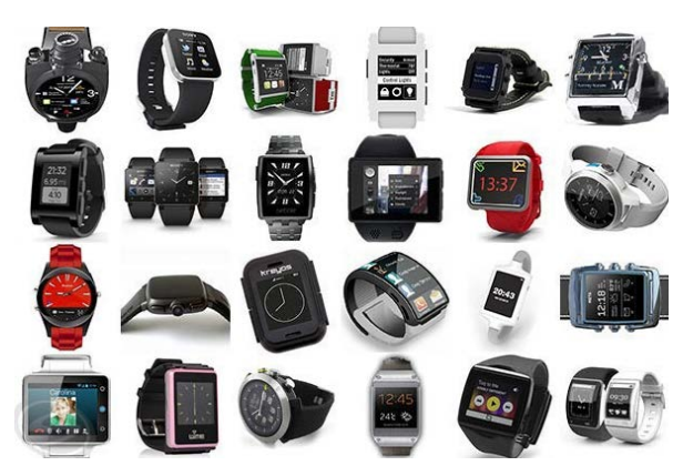
Fig.1. The Demonstration of the Contemporary Smart Watches

transmitted between the devices via blue-tooth control information and data information in the existing added head node sends data first. Cloud security is the most prominent problems in data security, although each cloud service providers are stated, its services in all aspects that very safe. But to the enterprise, especially in large companies, and relevant data is the lifeblood of the business, cannot be threatened by any form. Shown in Figure 1, we demonstrate the contemporary smart watches types.