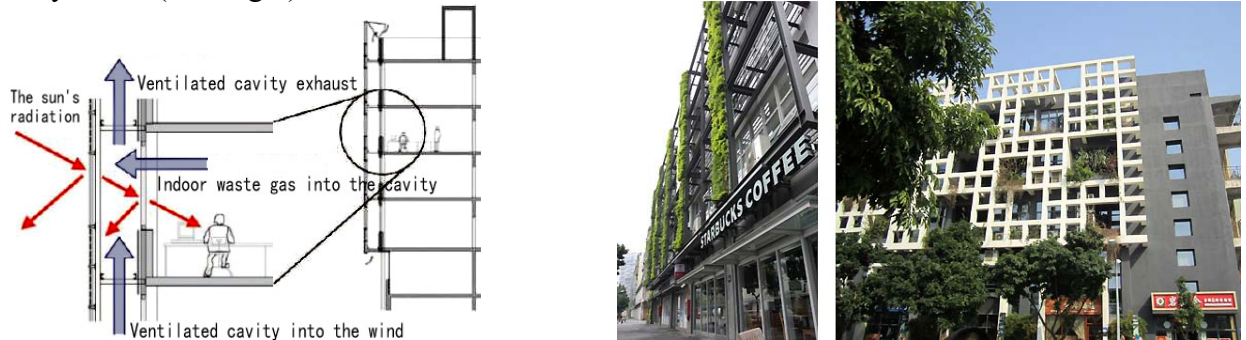
Fig. 1 reconstruction office buildings of Norwegian University of Science and Technology Fig. 2 The west side sun-shading system of the reconstruction project of No.1 and 2 buildings at Yiku of Nanhai Sea, Shenzhen

inlets to let thermal radiation be brought off in the outermost layer by cross-ventilation resulting from chimney effect (See Fig.1).